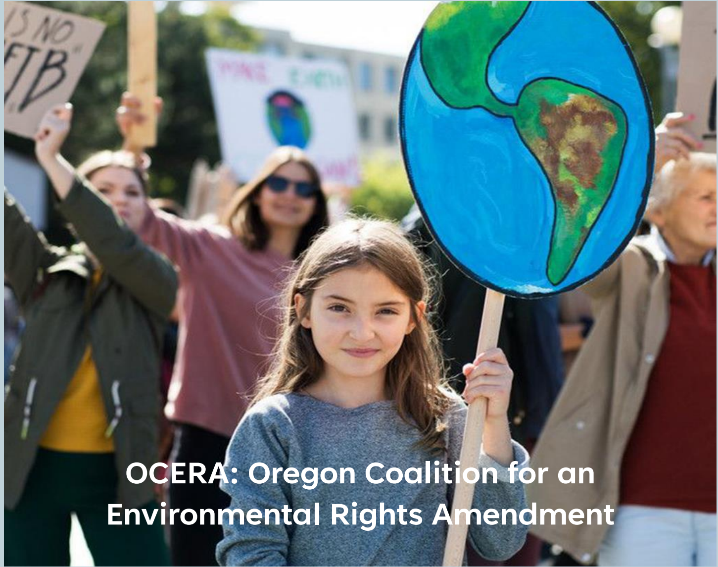
OCERA: Oregon Coalition for an Environmental Rights Amendment